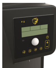
Onboard Control Panel