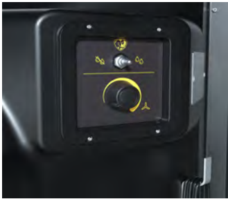
Onboard Variable Speed Control