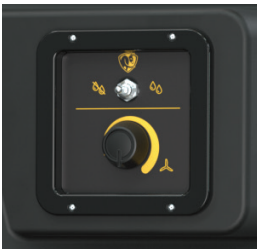
Onboard Variable Speed Control